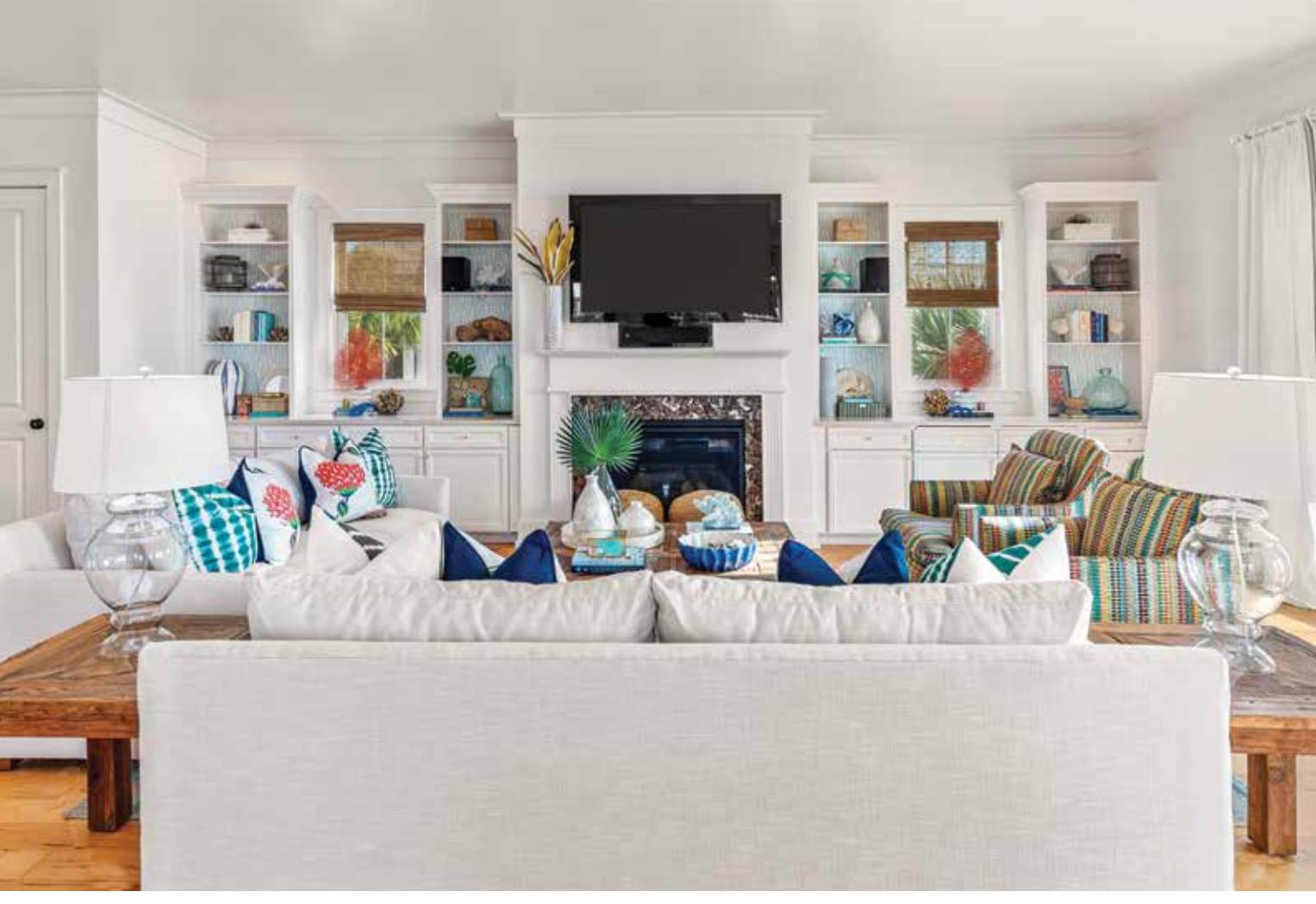
COMFY QUARTERS. Dreamy blue accents make these interiors feel as invigorating as a breath of fresh ocean air. "Every room contains a various shade of blue," Aston says, "but each one is unexpected, from teal to aqua to navy, avoiding the more predictable beach-home color scheme."